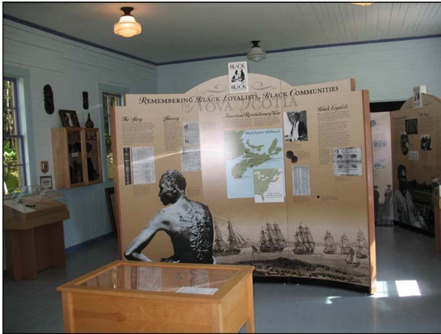
At left and below: interior of Black Loyalist Heritage Museum

The premier attraction at the site is the Black Loyalist Heritage Museum, but there is also a burial ground, a church, a heritage walking trail and a heritage museum and gift shop. We found the museum exhibits to be very interesting and very impressive. It was well worth the visit and I encourage anyone else who finds himself along Nova Scotia's South Shore to make time to visit Birchtown (and of course Shelburne).